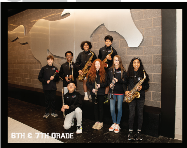
6TH & 7TH GRADE