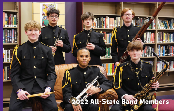
2022 All-State Band Members